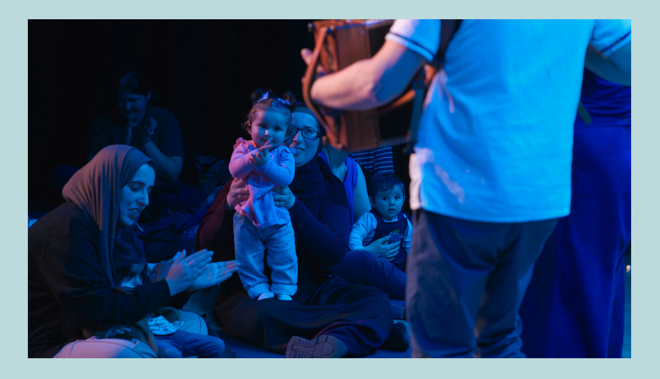
'Lovely and unique musical magic. Very enjoyable for me and the little one (particularly like the interactive elements).'

'My little one really enjoy this session, he got really involved and was dancing'