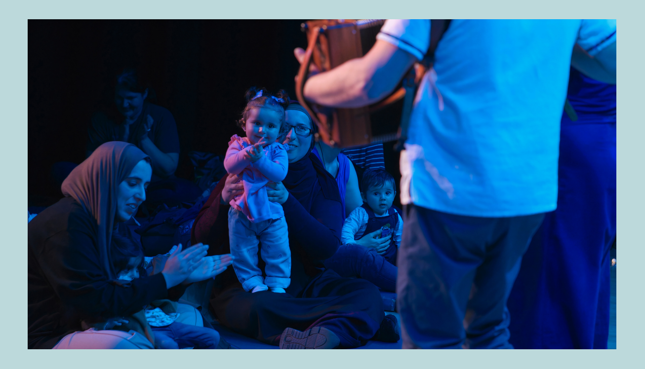
'Lovely and unique musical magic. Very enjoyable for me and the little one (particularly like the interactive elements).'

'My little one really enjoy this session, he got really involved and was dancing'